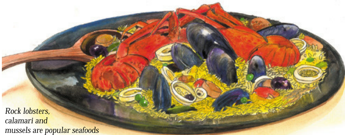
Rock lobsters, calamari and mussels are popular seafoods

Aquaculture accounts for 83 percent of the world's supplies of bivalve molluscs such as mussels, oysters and scallops . In South Africa Mediterranean mussels Mytilus galloprovincialis are grown on ropes which are suspended from rafts in sheltered bays like Saldanha. The cultivation of oysters takes place mainly in the Knysna lagoon where the Pacific oyster, Crassostrea gigas , is grown in mesh bags that are suspended from wooden racks. C. gigas is the most commonly cultivated oyster species